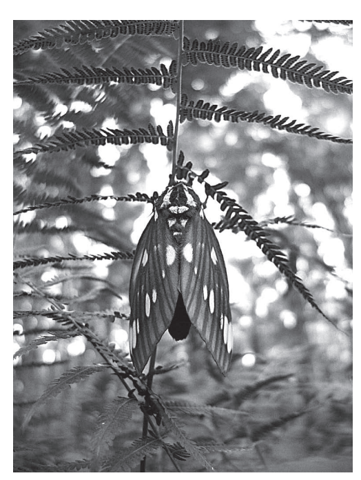
First prize "A New Way of Being"