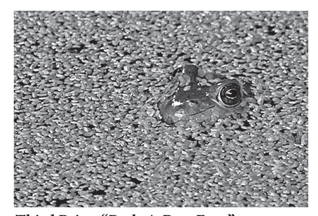
Third Prize "Peek-A-Boo-Frog"