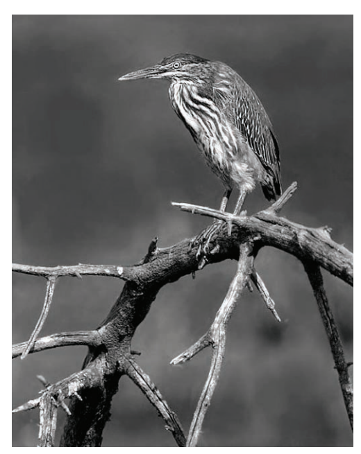
Second Prize "Perched"